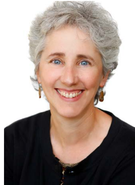
Paige Chapel Aeris